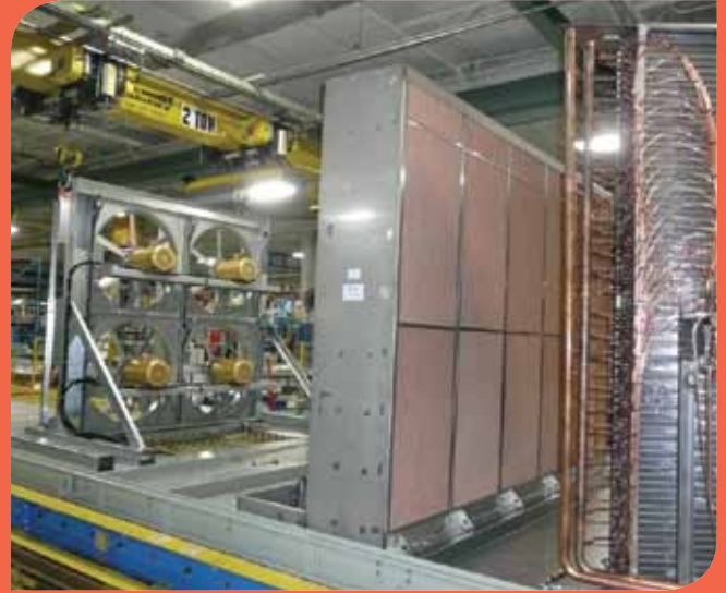
Evaporative cooling can be built into Trane packaged systems such as the IntelliPak Rooftop System shown below.